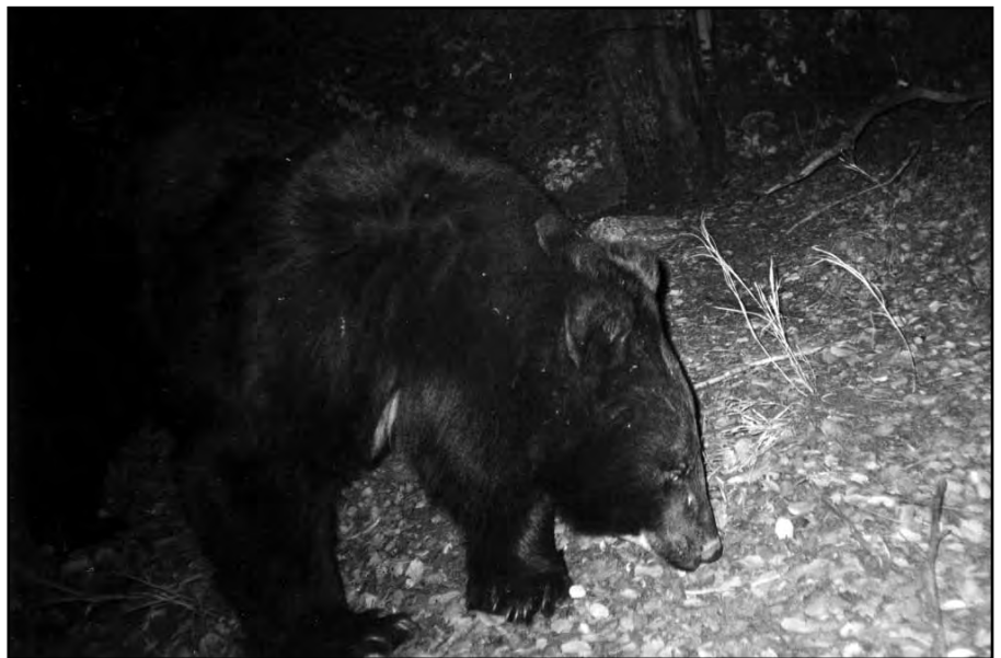
Asiatic black bear camera-trapped in the central-south part of Nuristan province, Afghanistan, November 2007.