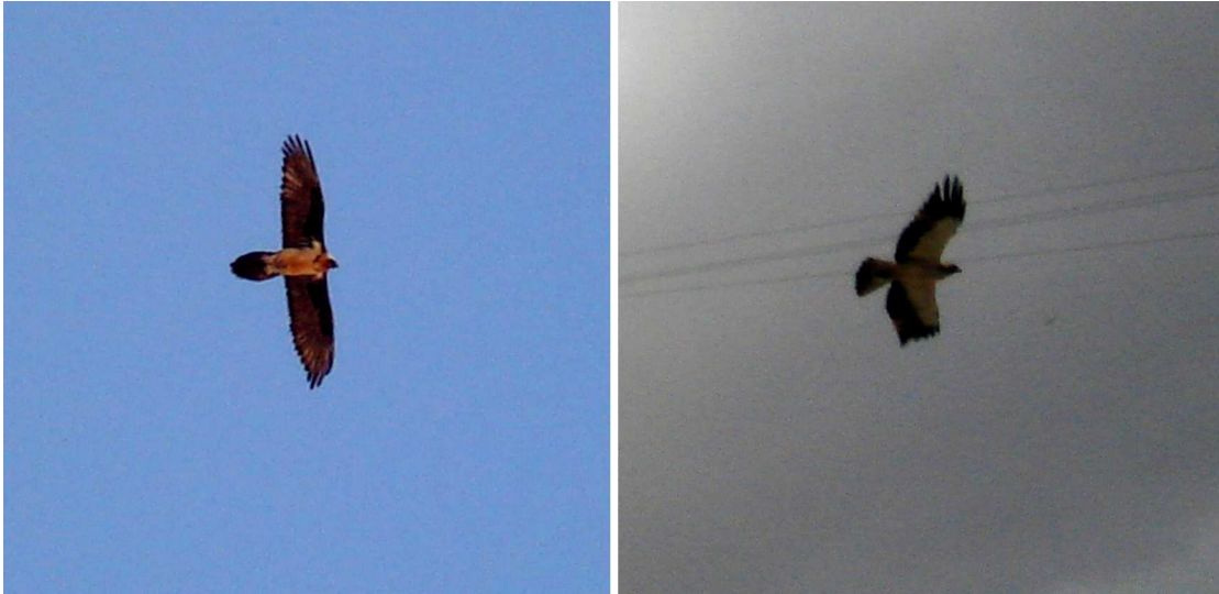
From left to right: Plate 13. A large diversity of diurnal raptors can be seen in Dasht-e Nawar. Here, the huge lammergeier ( Gypaetus barbatus ), known to occur throughout central highlands of Afghanistan. Dasht e-Nawar, April 2007. Plate 14. An adult specimen of the small and compact booted eagle ( Hieraetus pennatus ) in clear color morph, August 2007. The status of this species in Dasht-e Nawar is unclear, a summer visitor, breeder or early migrator? The species is also a new addition to the bird list of Dasht-e Nawar.

There is little doubt that because of their paucity in the country, sizeable wetlands, such as Dasht-e-Nawar, which provide extensive resting and foraging habitat, must be of crucial importance for migrating water birds.