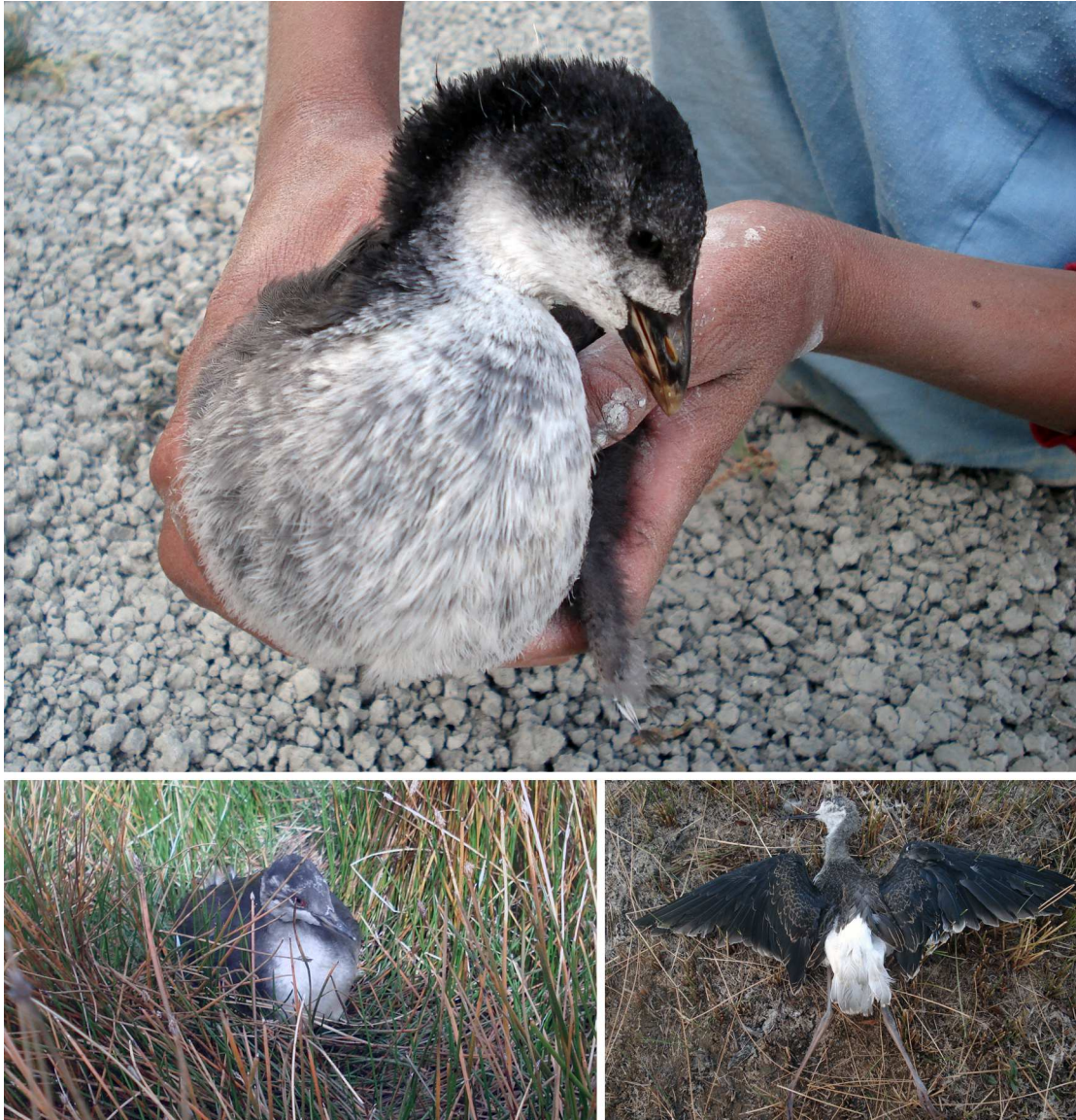
From top, counterclockwise: Plate 10. A juvenile coot ( Fulica atra ) found in the reed beds in Dasht-e Nawar, August 2007. Plate 11. A juvenile great crested grebe ( Podiceps cristatus ) in the reed beds in Dasht-e Nawar, August 2007. This species is a new addition to the bird list of Dasht-e Nawar, and is for the first time confirmed to breed in central highlands of Afghanistan. Plate 12. A newly-fledged black-winged stilt ( Himantopus himantopus ) found dead of unknown reason, August 2007. The species was already recorded to breed in Dasht-e Nawar in the 1970s.

Ornithologists from former Soviet Union have considered the waterfowl populations occurring in most parts of Afghanistan during autumn migration as part of a 'Siberian–Kazakhstan/Pakistan–India' biogeographic unit. This population breeds in and around the Ob River of northern Russia and winters in the Indus river drainage (Isakov and Shevarera, 1967, cited in Shank and Rodenburg, 1977). Although very few ornithological surveys have been carried out in Afghanistan, anecdotic observations support this earlier delineation. The Siberian crane ( Grus leucogeranus ) for example has been recorded in Ab-e Estada (Shank and Rodenburg, 1977).