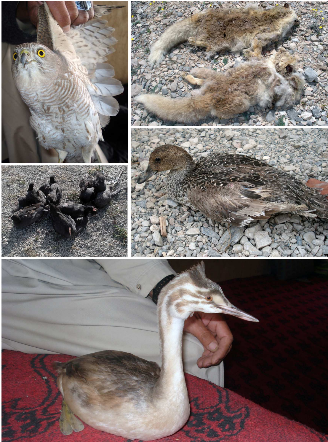
From top; clockwise: Plate 4. An adult European sparrowhawk ( Accipiter nisus ) recently captured in Dasht-e Nawar, April 2007. Plate 5. Two red foxes ( Vulpes vulpes ) found dead near Nawabad village in Dasht-e Nawar, April 2007. They were killed by local people as retaliation to poultry losses. Plate 6. In summer molting waterfowls such as this common teal ( Anas crecca ) are captured by local people for food, August 2007. Plate 7. This great crested grebe ( Podiceps cristatus ) was captured as a flightless juvenile in Dasht-e Nawar. Now imprinted to humans it is kept in the backyard pool of a household with domestic fowls, August 2007. Plate 8. A flock of hand-captured coots ( Fulica atra ) brought back to the village by local hunters. We suspect that coots suffer heavy losses from hunting during molting season, August 2007.