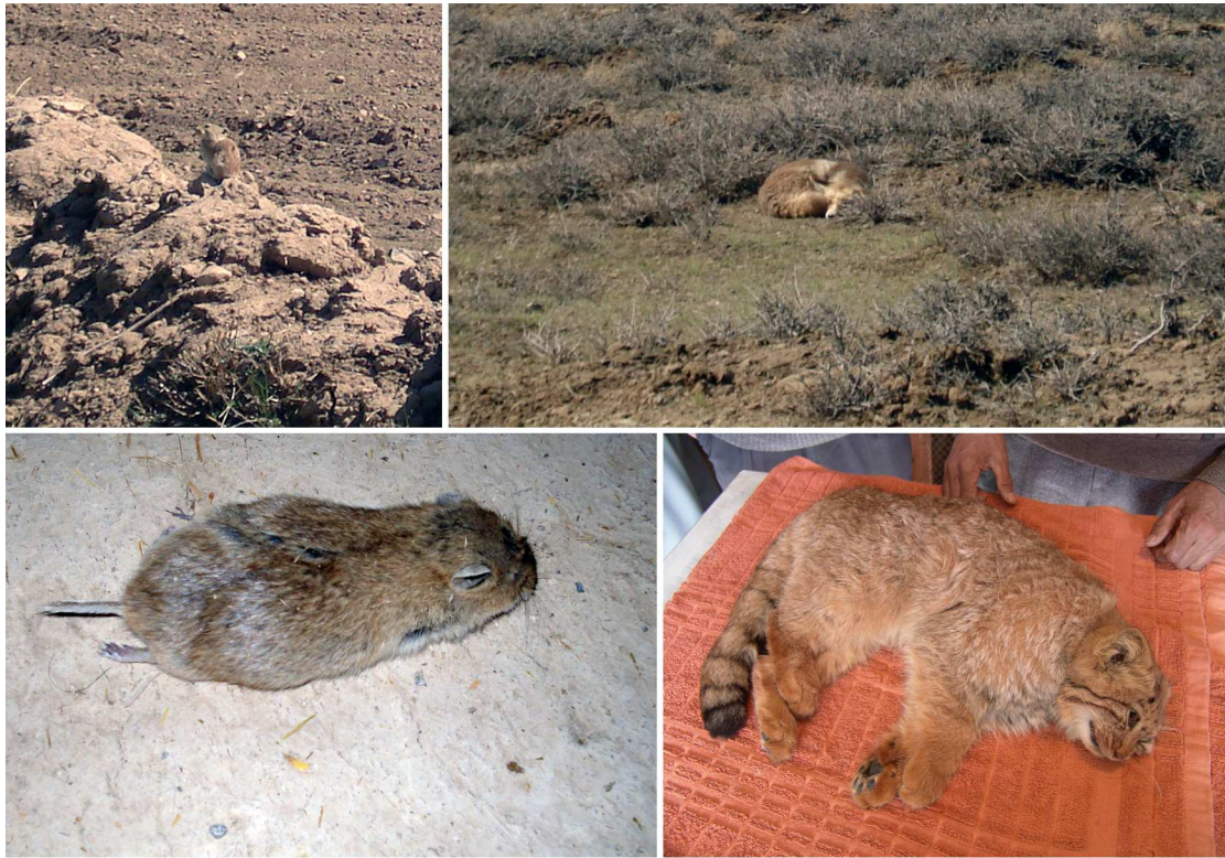
From top left, clock wise: Plate 17. An Afghan pika ( Ochotona rufescens ) sunbathing in agricultural fields around Bukharah village, Dasht-e Nawar, April 2007. Plate 18. A red fox ( Vulpes vulpes ) sleeping in open land on the fringe of wet grasslands (biome 3) near Nawabad, Dasht-e Nawar, April 2007. Plate 19. An anesthetized Pallas' cat ( Otocolobus manul ) at Kabul zoo, in November 2006. This specimen was allegedly captured in autumn 2006 in Nawar district. Plate 20. A specimen of vole, presumably an Afghan vole ( Microtus afghanus ) captured in agricultural fields in Dasht-e Nawar, August 2007.