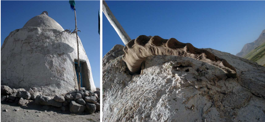
From left to right: Plate 15. Alpine ibex ( Capra [ibex] sibirica ) horns decorate the roof of a religious shrine in Dasht-e Nawar, April 2007. Plate 16. Detail of an Alpine ibex horn embedded in the wall coating of a religious shrine in Dasht-e Nawar, April 2007.