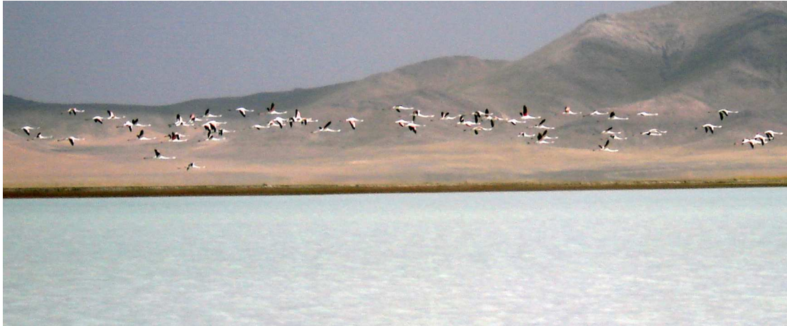
Plate 9. A flock of greater flamingoes ( Phoenicopterus roseus ) over Ab-e Nawar in, Dasht-e Nawar, August 2007. We confirmed the breeding of this species 30 years after the last report.

It was our impression that coots in particular were captured in large numbers. One group of three hunters brought back to the village 11 of them captured during one afternoon (Plate 8). No mention was made of egg collection activities. Interviewees mentioned that for religious reasons flamingoes, egrets, cranes, other herons and hares are not hunted (see below).