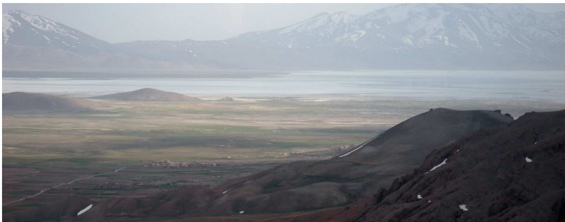
From top to bottom: Plate 1. Dr. Ali Madad Rajab, a research assistant of the WCS Afghanistan Biodiversity Project, standing in Dasht-e Nawar plain shortly before the peak of spring snow melt in April 2007. Three months later this area was partially flooded. Plate 2. Dr. Ali Madad Rajabi takes a GPS location of a mudflat in Dasht-e Nawar, August 2007. Plate 3. A general view of Dasht-e Nawar in spring 2007 showing the three main biomes encountered in the area. On the foreground, east-facing mountain slopes and adjacent foothills (biome 1), then a village with cultivated areas (biome 2) and in the background, grass-meadow, mudflat, and brackish lakes (biome 3).