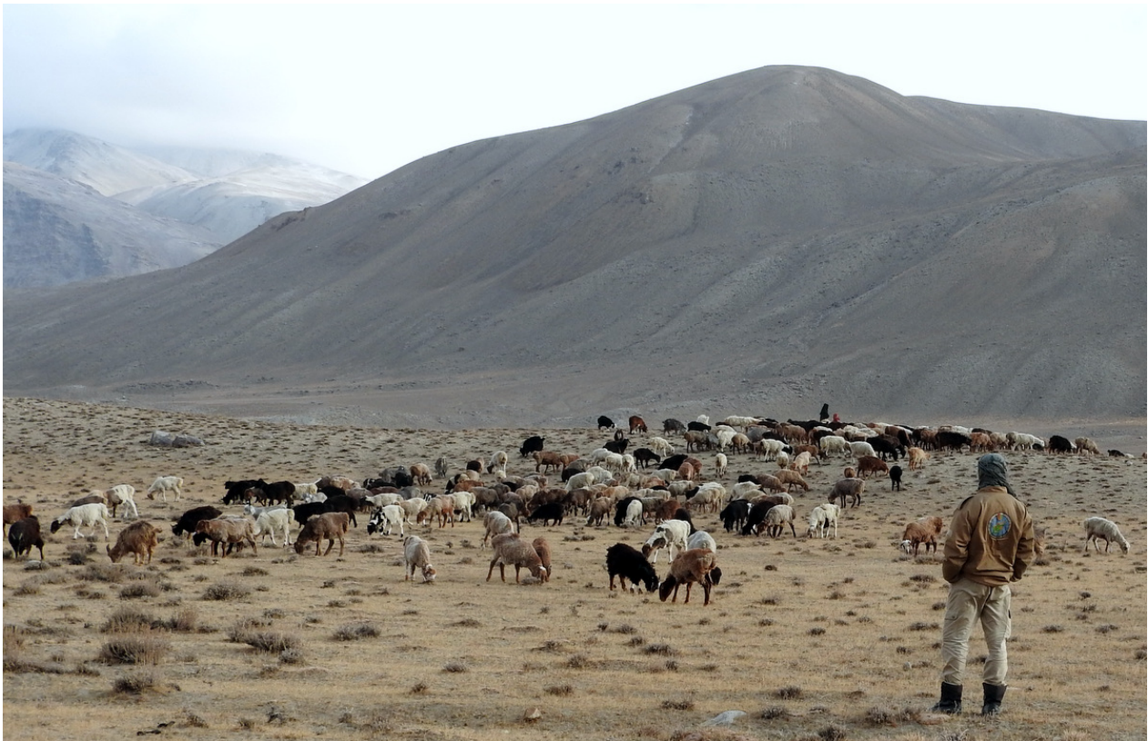
A community ranger counting sheep and goats in Big Pamir, October 2017